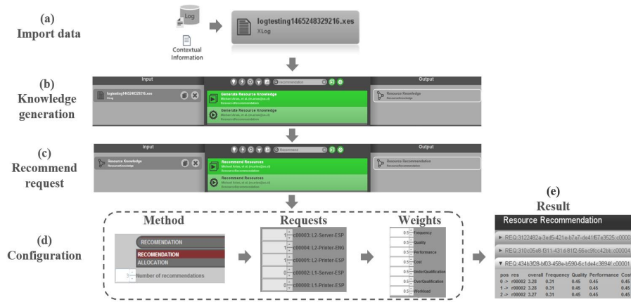
Fig. 2. General walkthrough of the ResRec tool in ProM

Note that the ResRec tool is designed to be generic and extensible, being able to incorporate new criteria to evaluate the resources, so as to make the resource allocation a more effective task. Moreover, the framework can be adapted to be used in any domain or scenario.